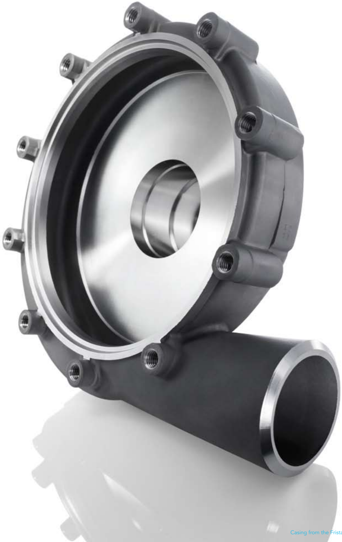
Casing from the Fristam FPH